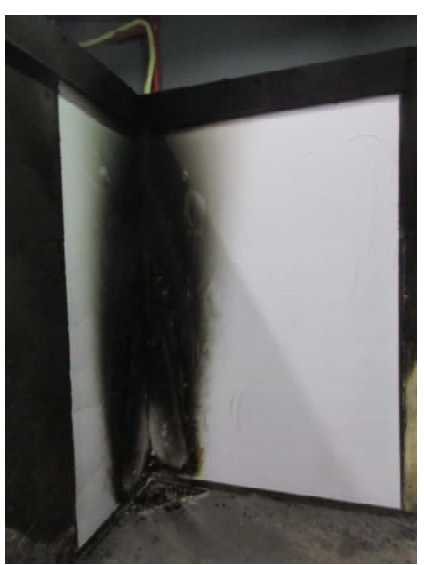
After Test (EN 13823)